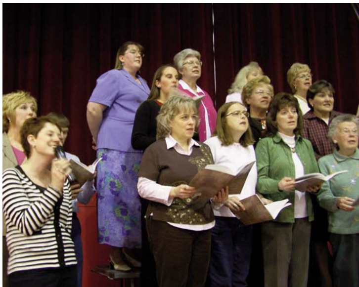
to the grandparents to start to process of Lighting the Vision